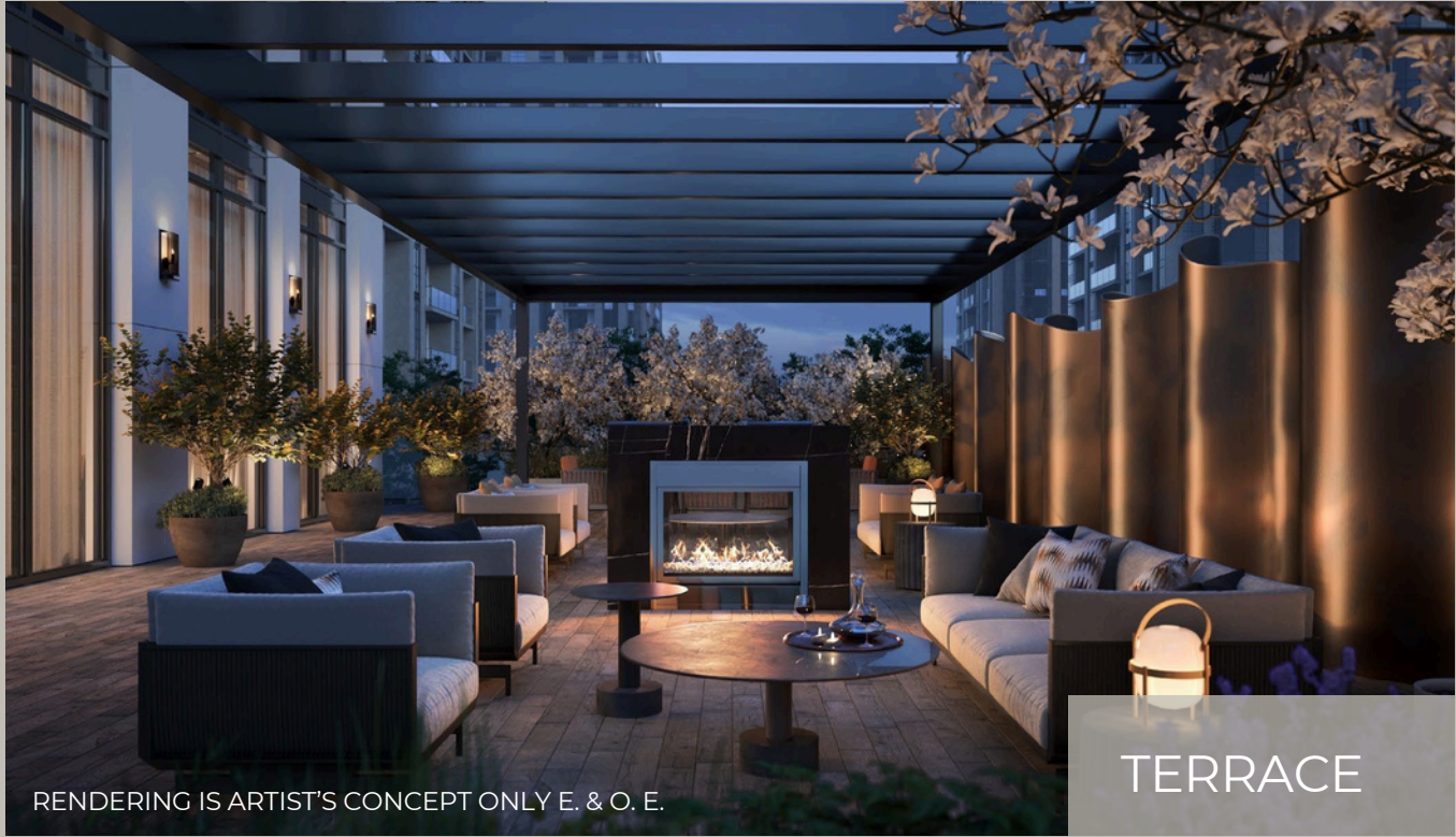
RENDERING IS ARTIST'S CONCEPT ONLY E. & O. E.