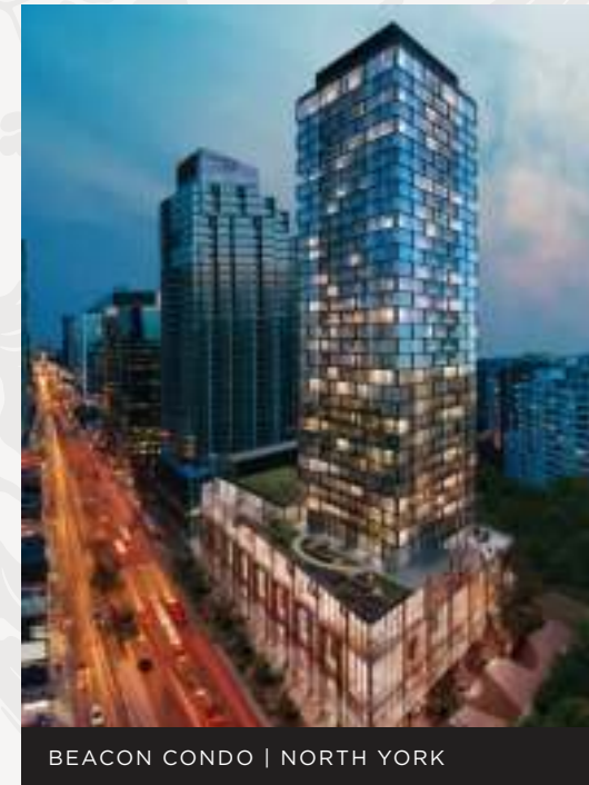
BEACON CONDO | NORTH YORK

The best testament to our community commitment is evident in our built form. A drive through both our completed communities and projects under construction is the perfect way to see Sorbara's commitment to our homeowners.