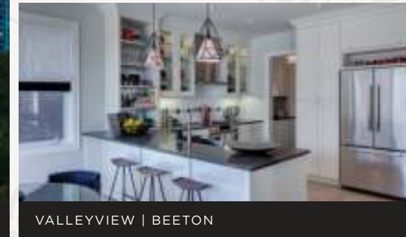
VALLEYVIEW | BEETON