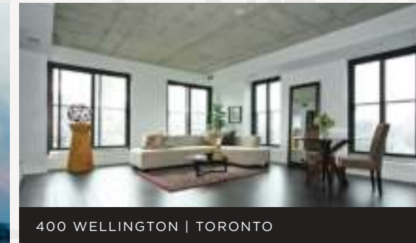
400 WELLINGTON | TORONTO