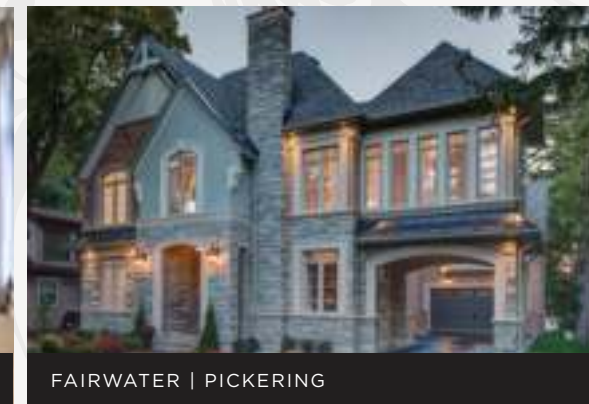
FAIRWATER | PICKERING