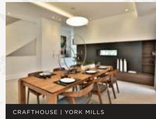
CRAFTHOUSE | YORK MILLS