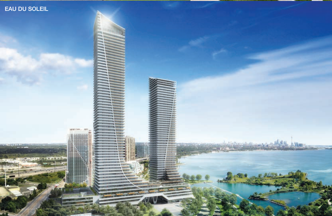
EAU DU SOLEIL