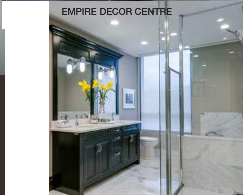
EMPIRE DECOR CENTRE