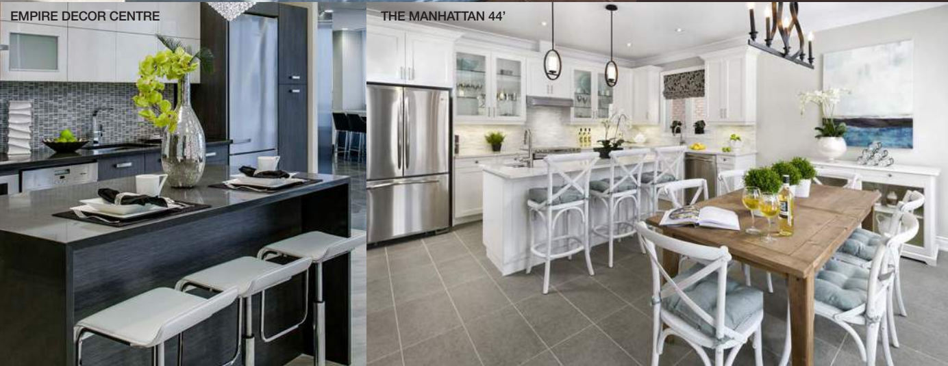
EMPIRE DECOR CENTRE