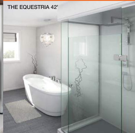
THE EQUESTRIA 42'