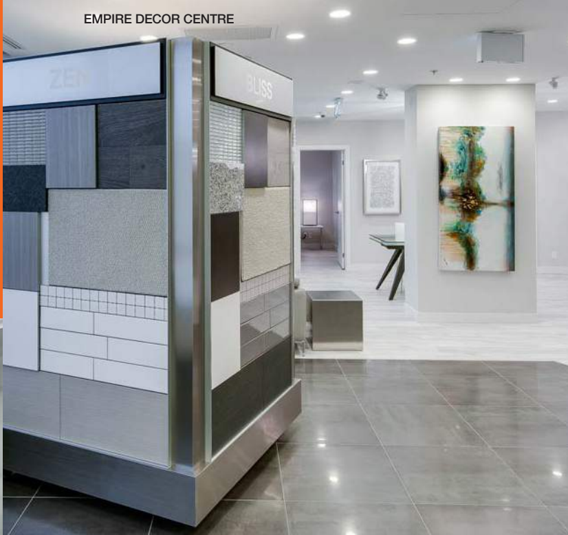
EMPIRE DECOR CENTRE