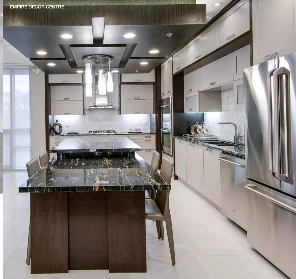
EMPIRE DECOR CENTRE