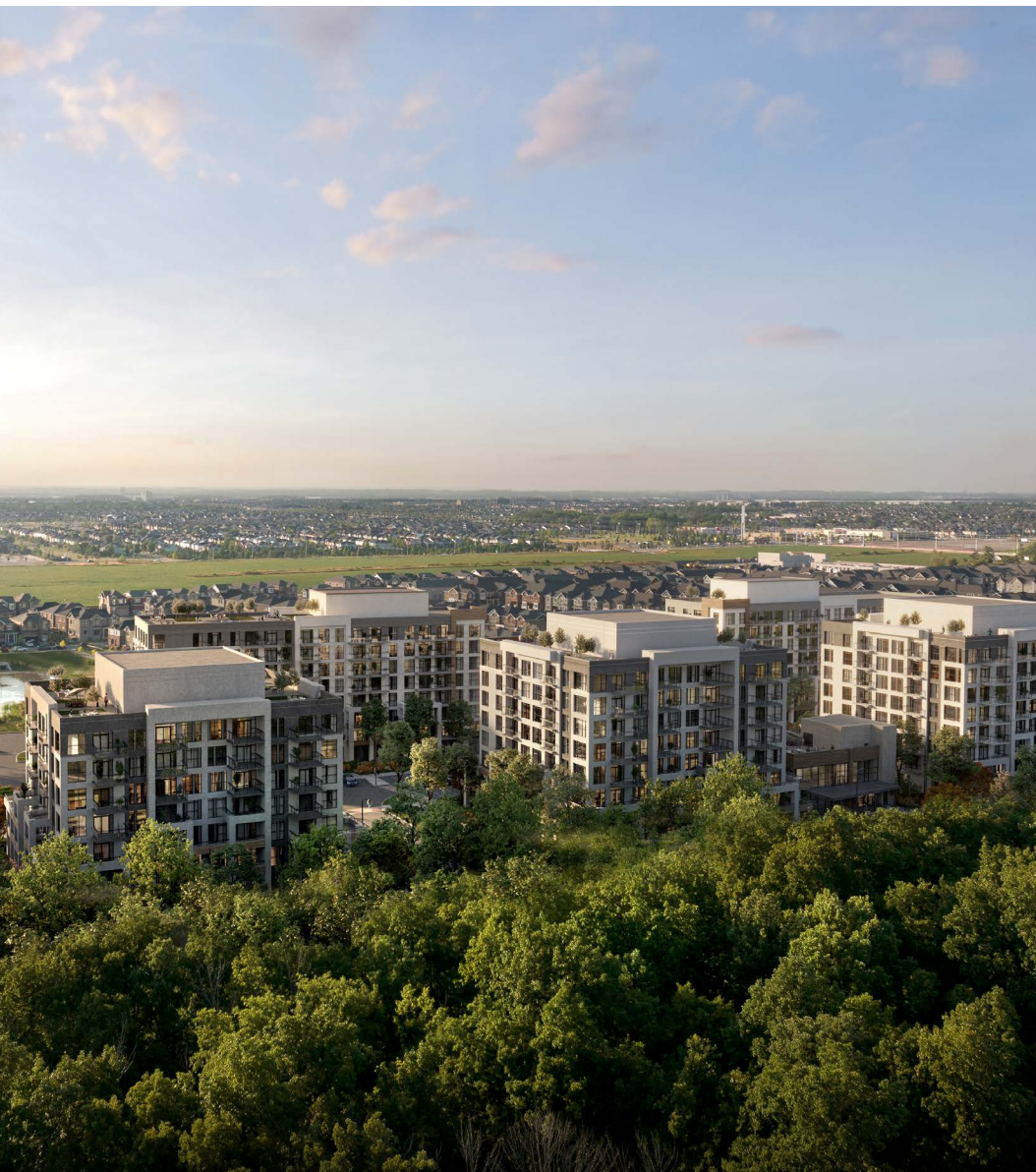
Mile & Creek, Milton

Step into the extraordinary at The Laurels by Mattamy Homes, where a meticulously planned neighbourhood blends urban vibrancy with the embrace of suburbia in Milton.