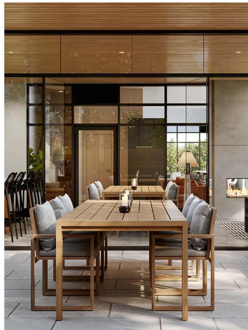
Carding House, Oakville