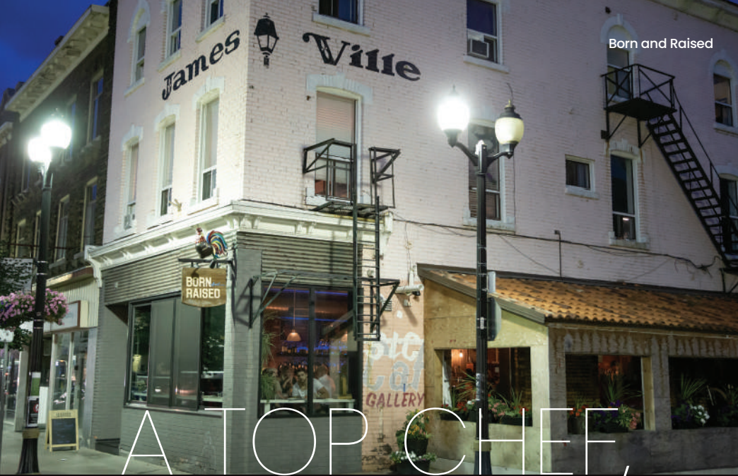
Born and Raised