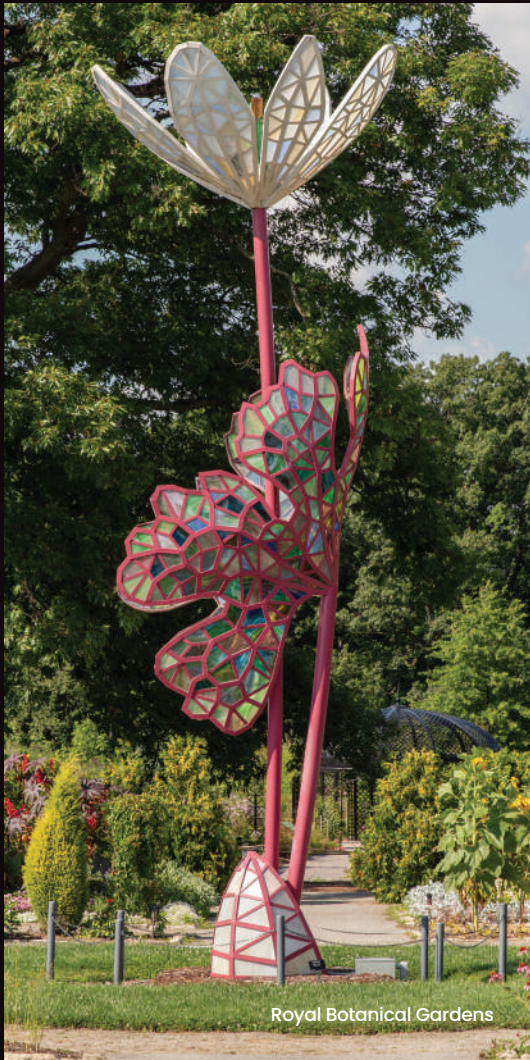
Royal Botanical Gardens