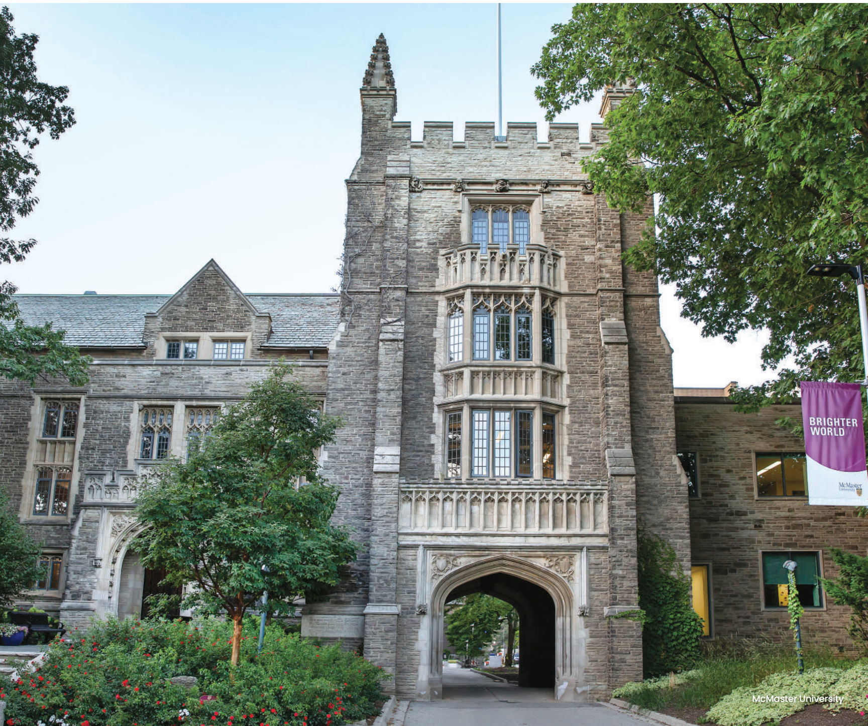
BRIGHTER WORLD McMaster University