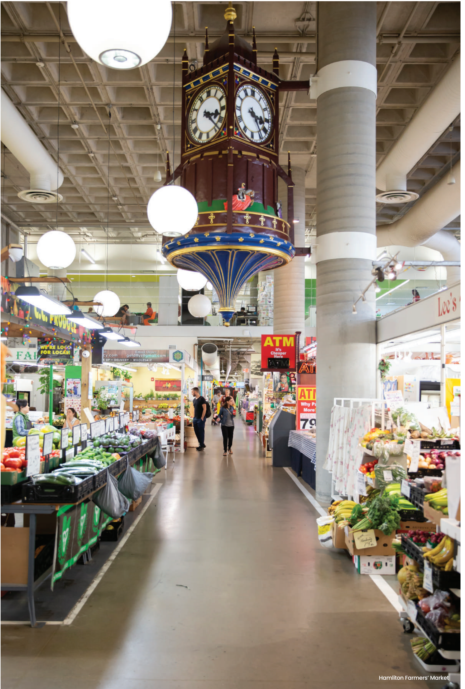
Hamilton Farmers' Market