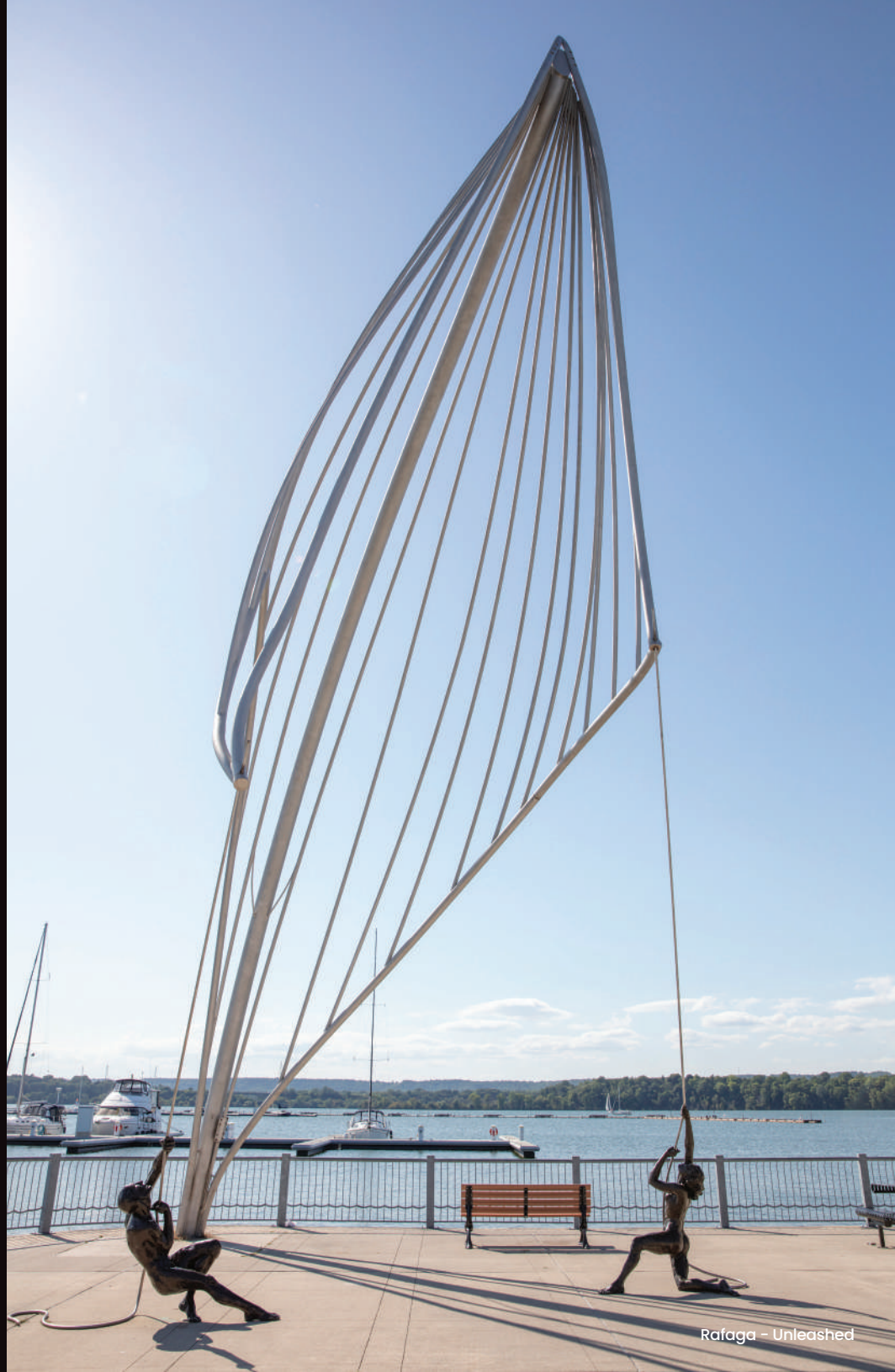
Rafaga - Unleashed

Every artful expression tells a story. Hamilton's current public art collection includes over 30 installations ranging from murals and sculptures to abstract works integrated into local streetscapes.