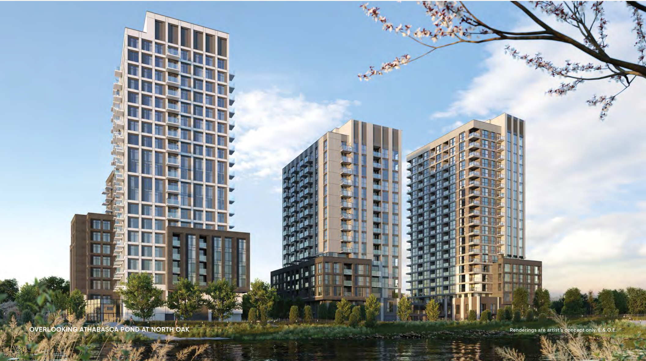
OVERLOOKING ATHABASCA POND AT NORTH OAK

At North Oak, design meets purpose; embedded into natural surroundings and integrating sustainable elements and forward-thinking technology.