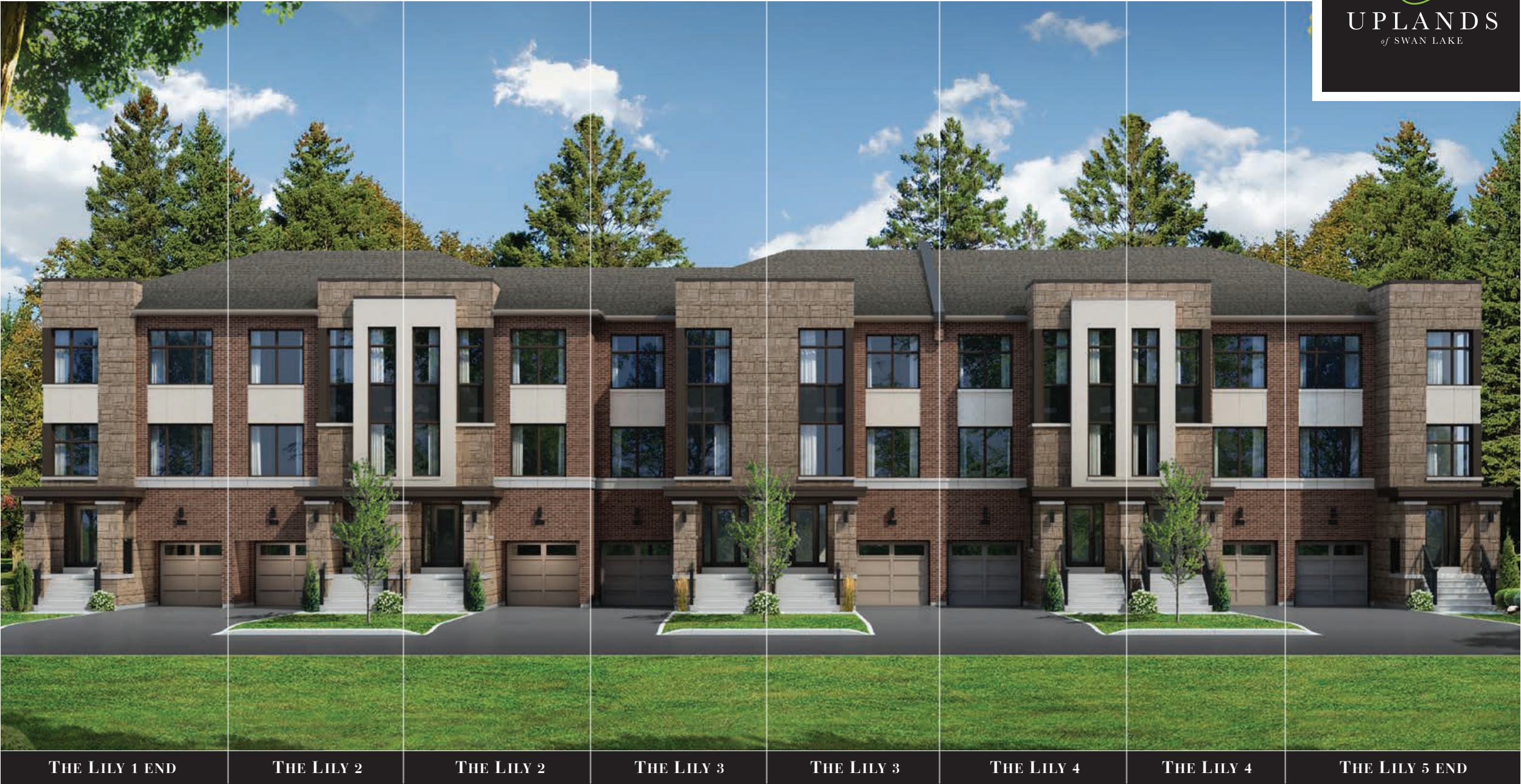
THE LILY 1 END