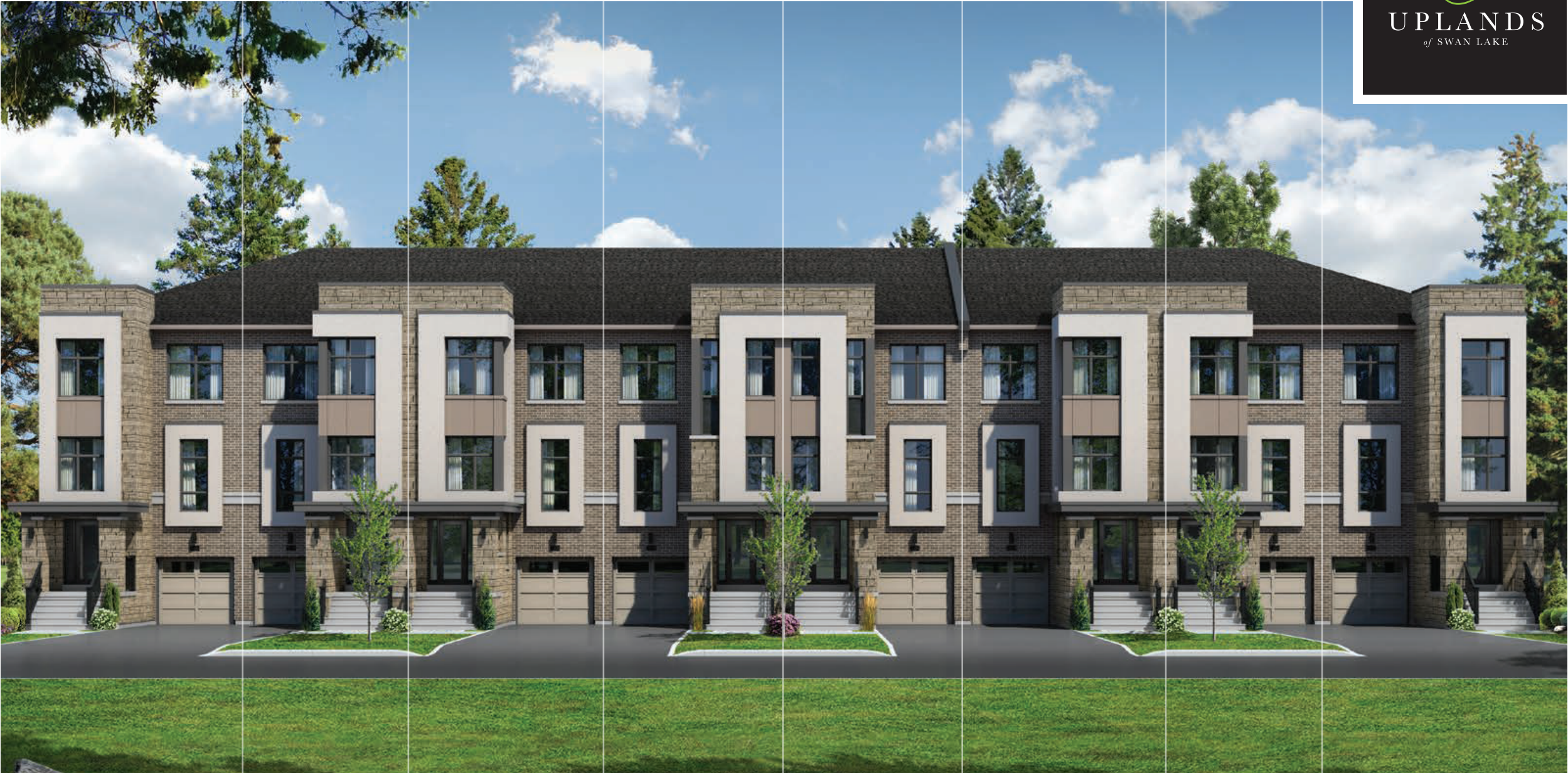
THE LILY 5 END