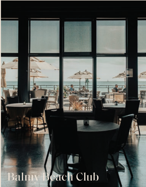
Balmy Beach Club