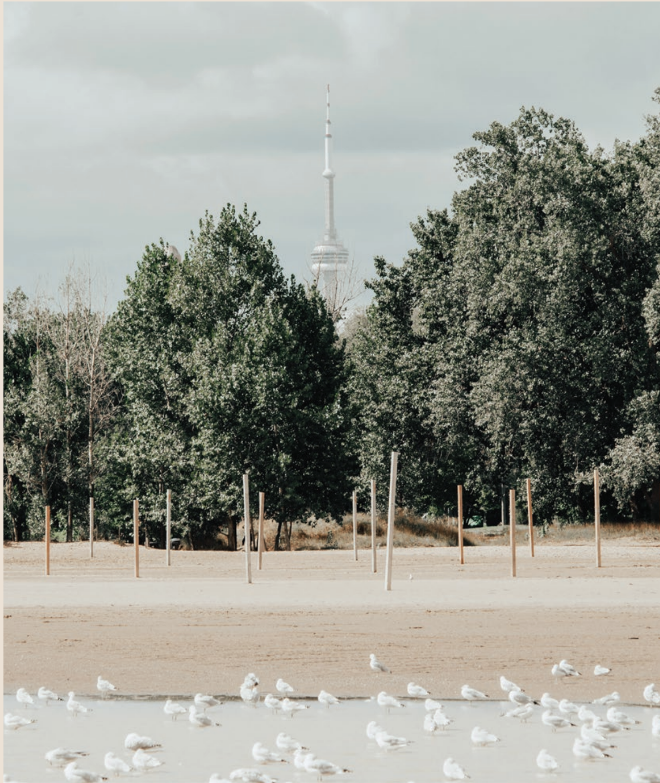
Woodbine Beach Park