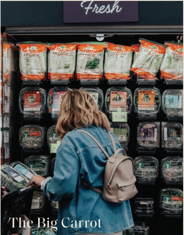
The Big Carrot