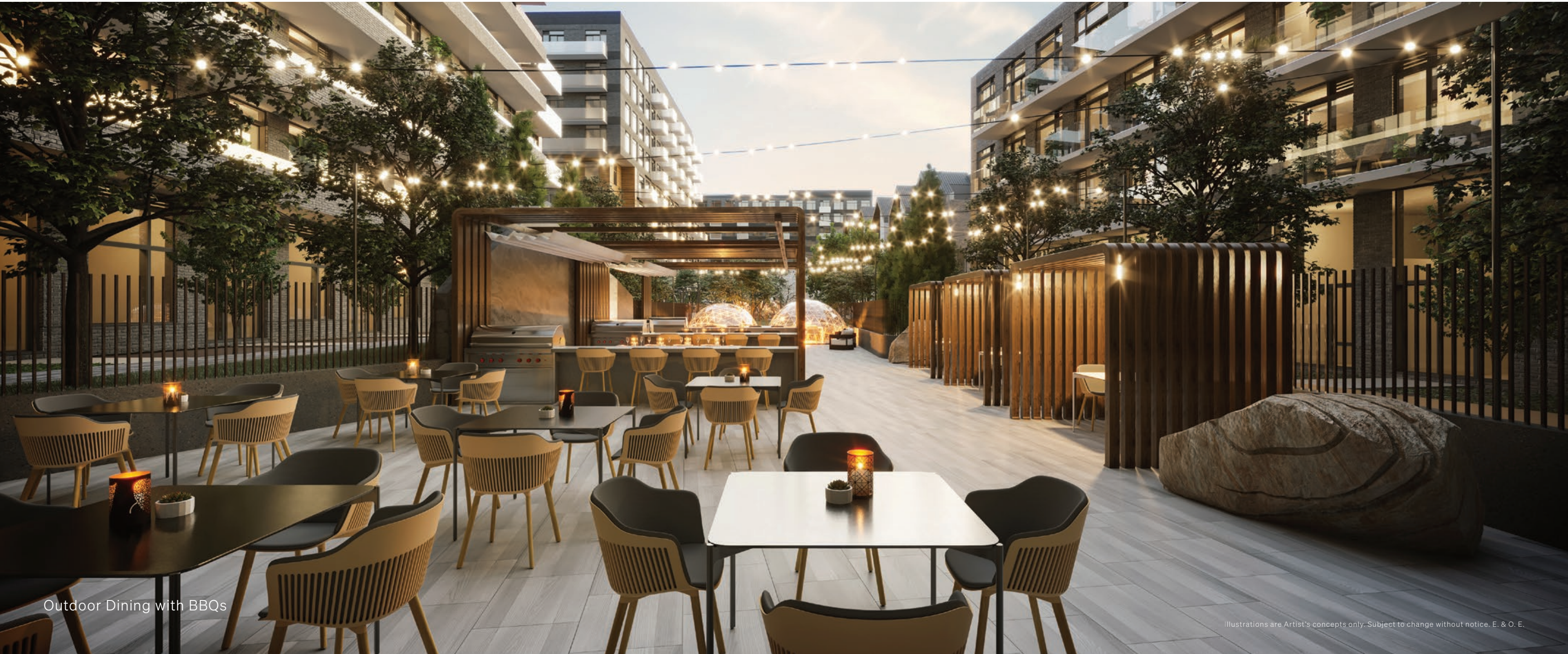
Outdoor Dining with BBQs

With an easy flow between indoors and out, you'll enjoy more time outside in lush greenery surrounded by trees and outcroppings, and more chances to connect with neighbours. Take a leisurely walk in the central green park. Shoot hoops in the basketball half-court. Treat yourself to a spa day around the fire pit. At Birchley Park, wellness is an accessible luxury.