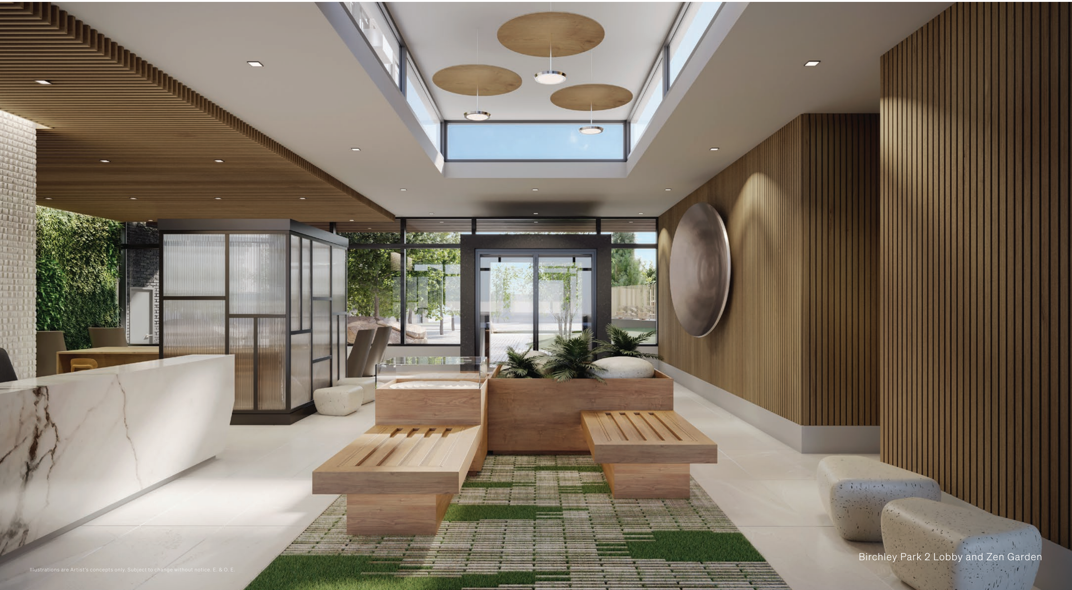
Birchley Park 2 Lobby and Zen Garden

Taking its cues from the colours and textures of nature, the tranquil lobby at Birchley Park welcomes residents and visitors with fresh and modern design.