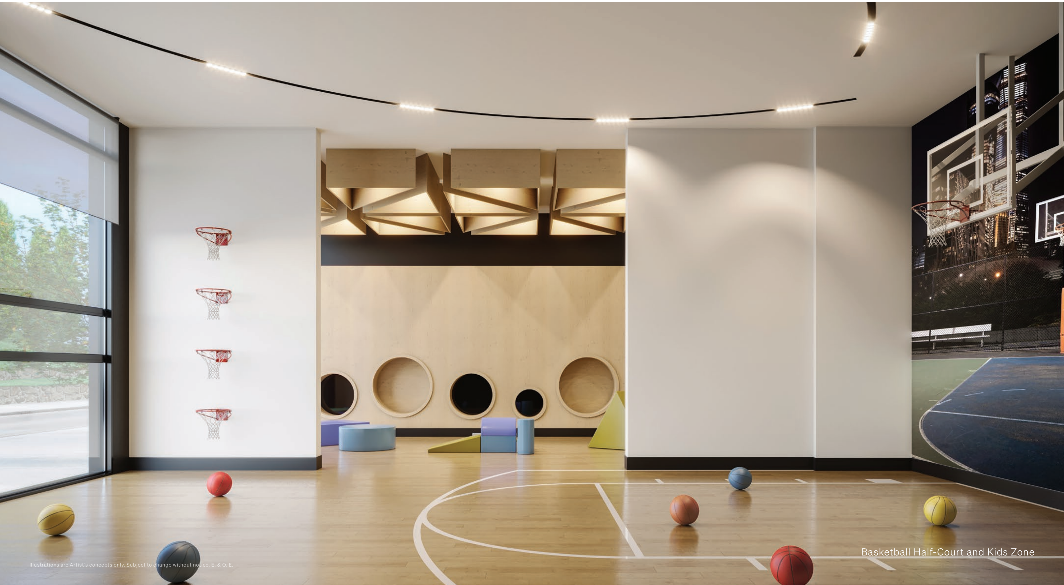
Basketball Half-Court and Kids Zone

Aspiring Raptors players or kids just looking to have fun at their favourite games will be thrilled to find a fully equipped gym with basketball half-court and practice baskets; an adjoining play space gives younger kids a place to explore and make new friends.