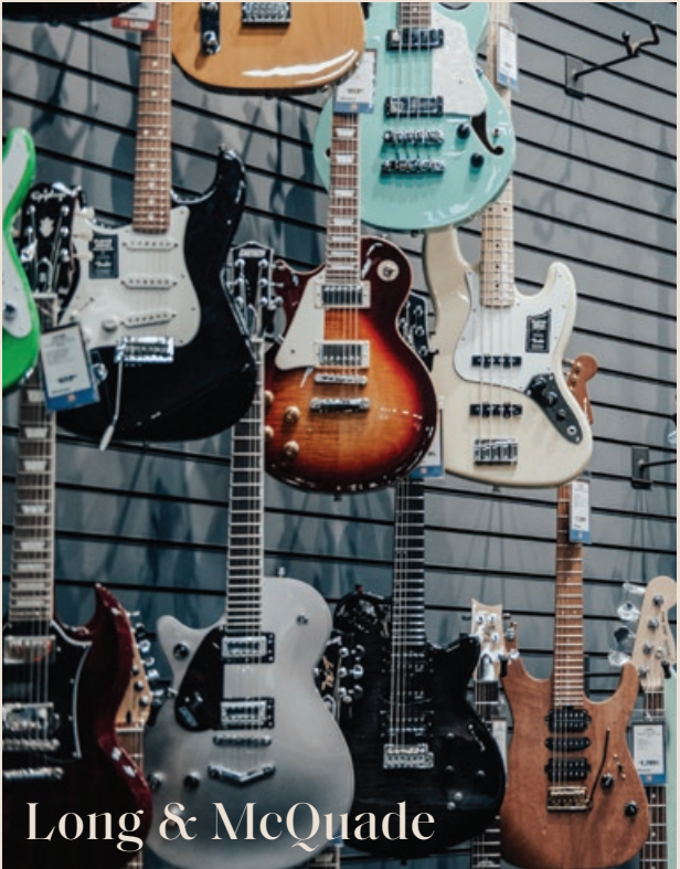
Long & McQuade