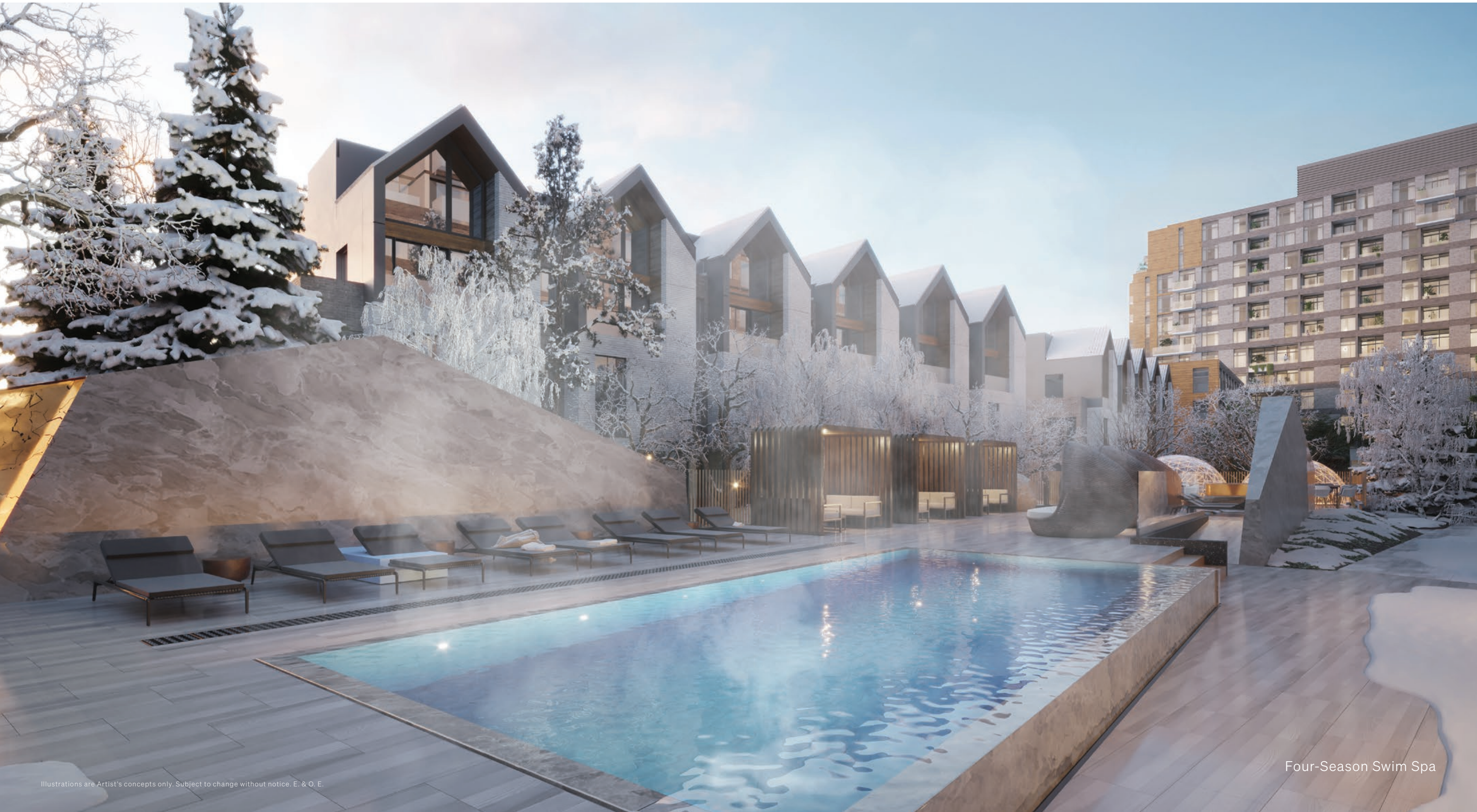
Four-Season Swim Spa

At the four-season swim spa with cabana lounges and fire terrace, you can feel the joy of reveling outdoors in the warm, soothing water, surrounded by refreshing cool air – a wellness experience inspired by Scandinavians' love of winter.