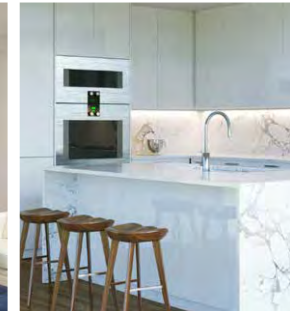
Choice of contemporary hi-gloss cabinetry, in addition to standard.