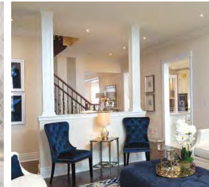
Upgraded contemporary square interior columns, as per plan.