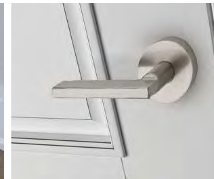
Upgraded interior door hardware.