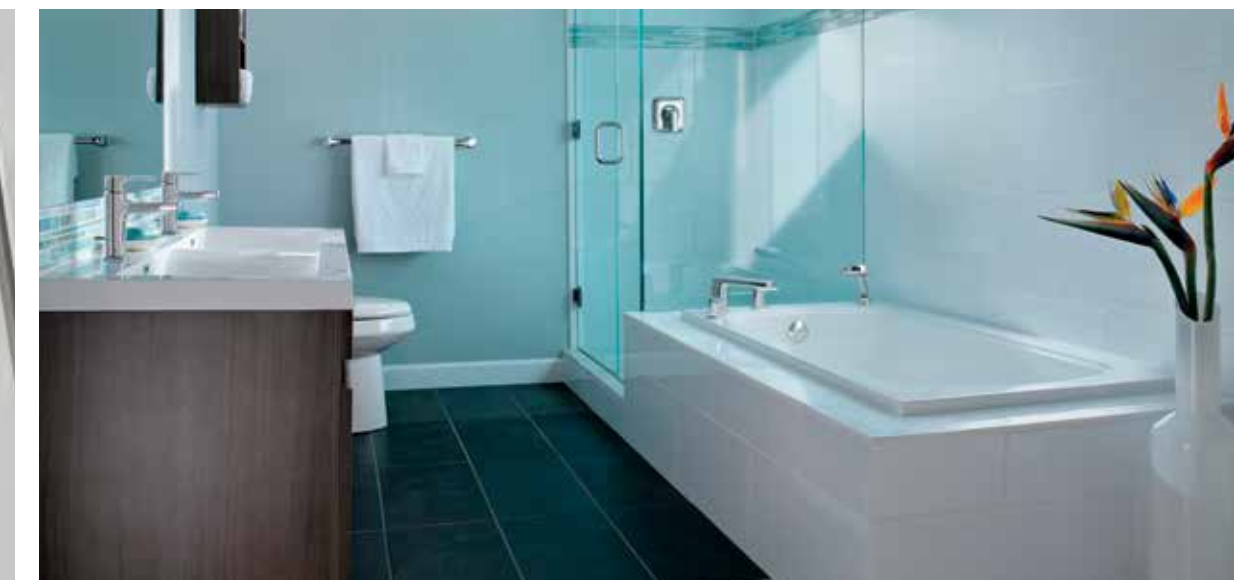
Upgraded rizon master bath & powder room faucet fixtures, as per plan.