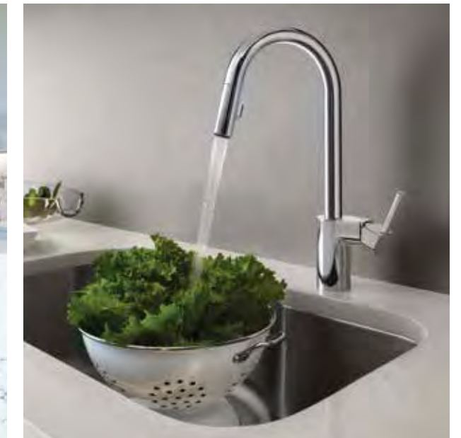
Upgraded Moen Align kitchen faucet with spray, chrome finish.