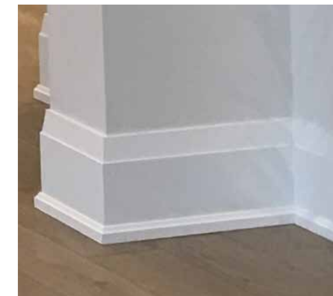
Contemporary interior trim package (4" baseboard and 2-3/4" casing).