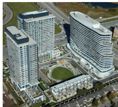
DANIELS ERIN MILLS PHASE 1 MISSISSAUGA