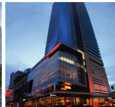
FESTIVAL TOWER ATOP TIFF BELL LIGHTBOX DOWNTOWN TORONTO