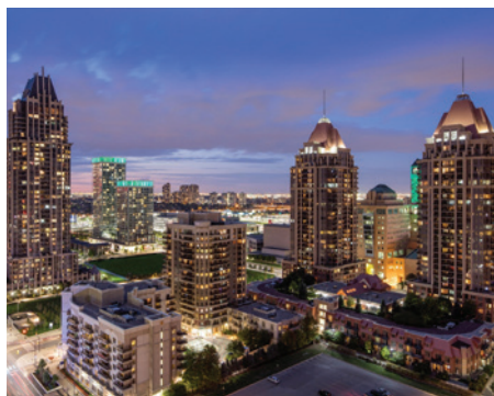
DANIELS CITY CENTRE MISSISSAUGA