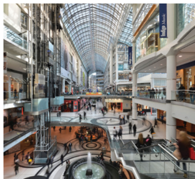
CF TORONTO EATON CENTRE DOWNTOWN TORONTO

Our promise that you will “love where you live” is woven into every aspect of our communities, starting with careful thought and consideration at every stage of the design and development of each community we build. When you purchase with Daniels, you can expect your new home to be built with the highest level of attention to detail. You can also feel confident in our all-inclusive approach that ensures excellence in construction quality and superior customer service from the day you purchase, to move in and beyond.