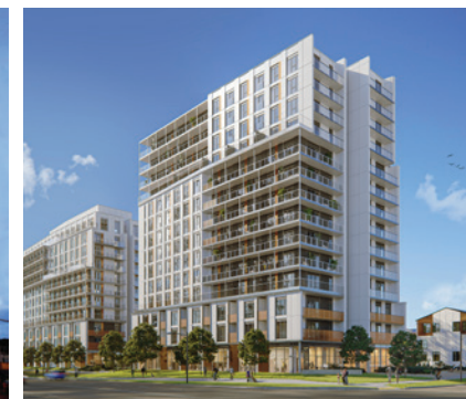
DANIELS MPV2 BRAMPTON