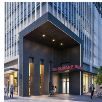
CONDOMINIUMS AT SQUARE ONE DISTRICT MISSISSAUGA