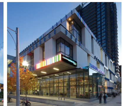
DANIELS SPECTRUM REGENT PARK