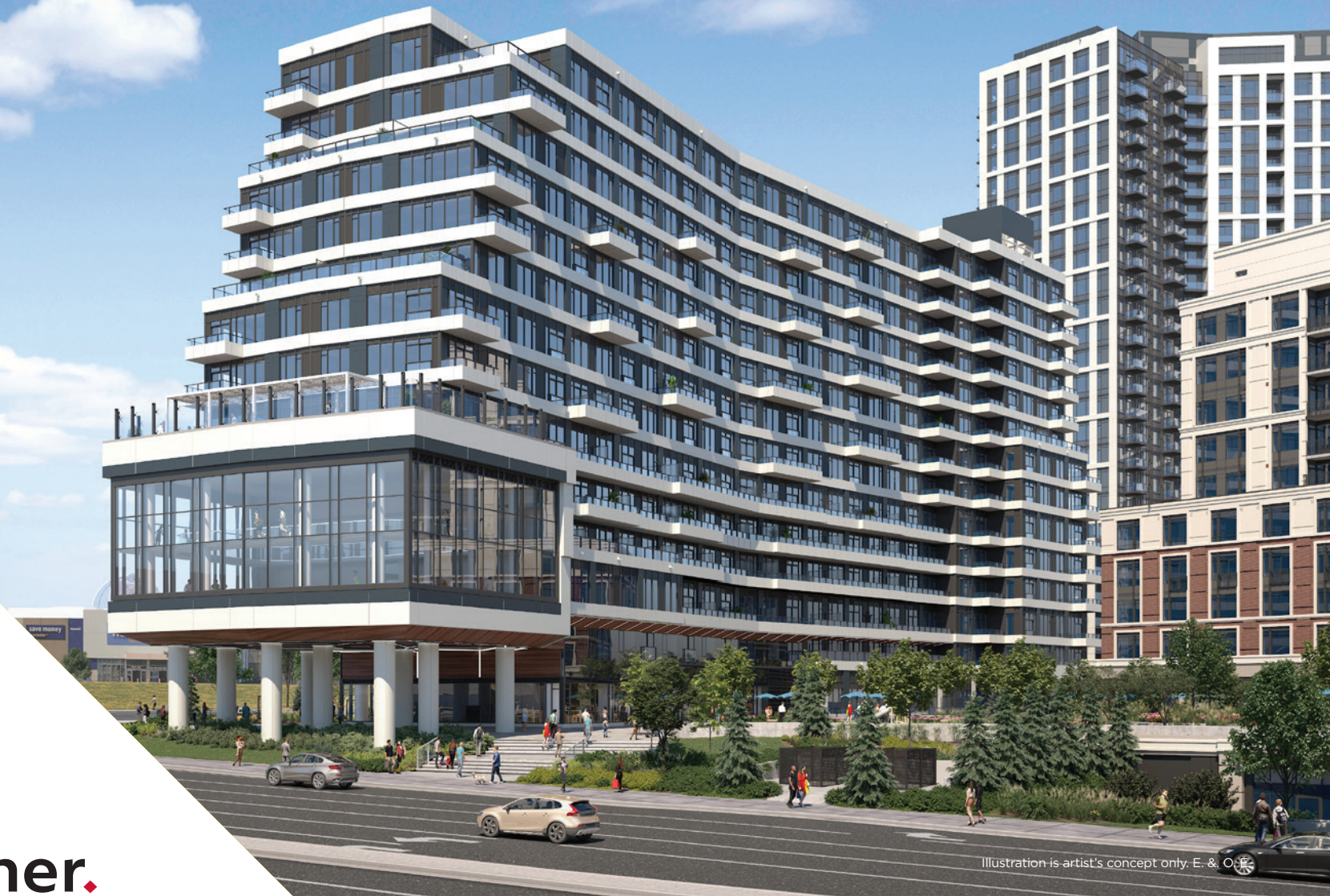
Illustration is artist's concept only. E. & O. E.